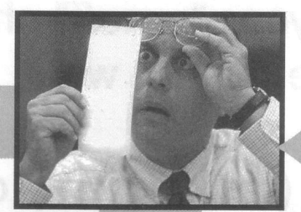
Is There a Majority?