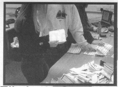
Eliminate Candidate with Fewest Number of Votes