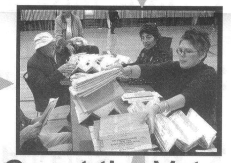
for each voter's highest ranked candidate that hasn't been eliminated

Redistribute Votes from Eliminated Candidate to Voters' Next Choices